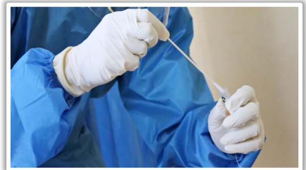
Our tests use a simple nasal swab to collect the sample.